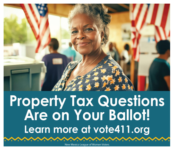
Ad #4: 25,655 impressions, 10,199 people reached, 143 engagements, 366 clicks

Ad #2: 20,873, people reached 9069, 158 engagements, 445 clicks