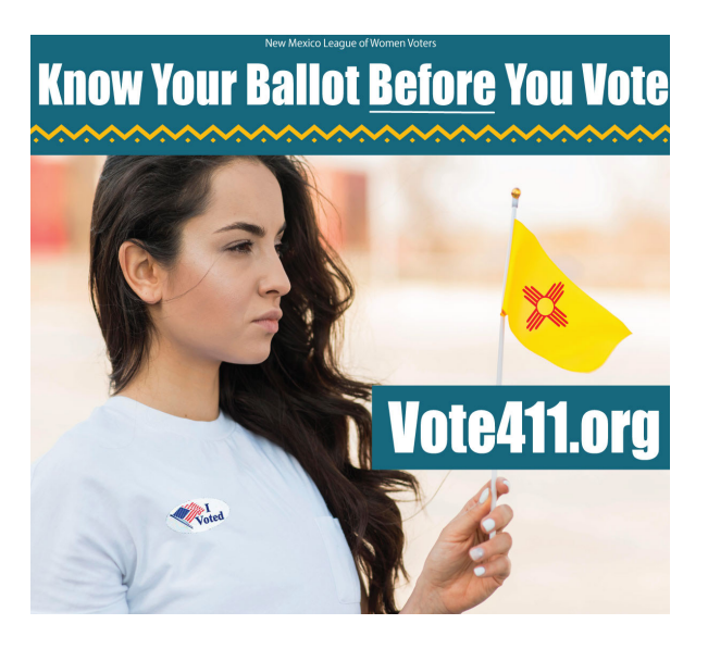
Ad #3: 37,808 impressions, 6708 people reached, 185 clicks

Ad #1: 23,600 impressions, 6835 people reached, 172 clicks