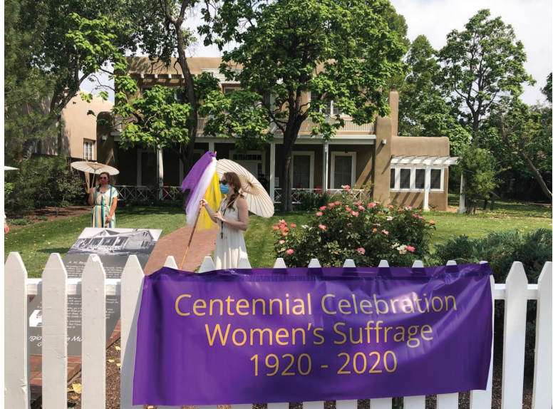
Alfred M. Bergere House in Santa Fe

We dedicate our lives to that purpose every day! Join us in making a difference!